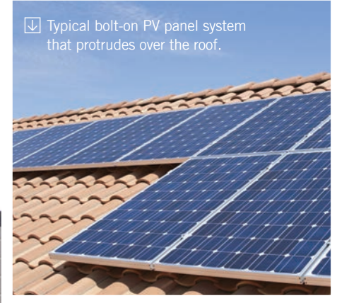
Typical bolt-on PV panel system that protrudes over the roof.