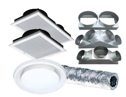
Duct Kit components