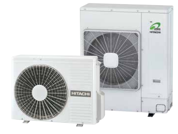
Outdoor Units (RAS-3 / RAS-4)